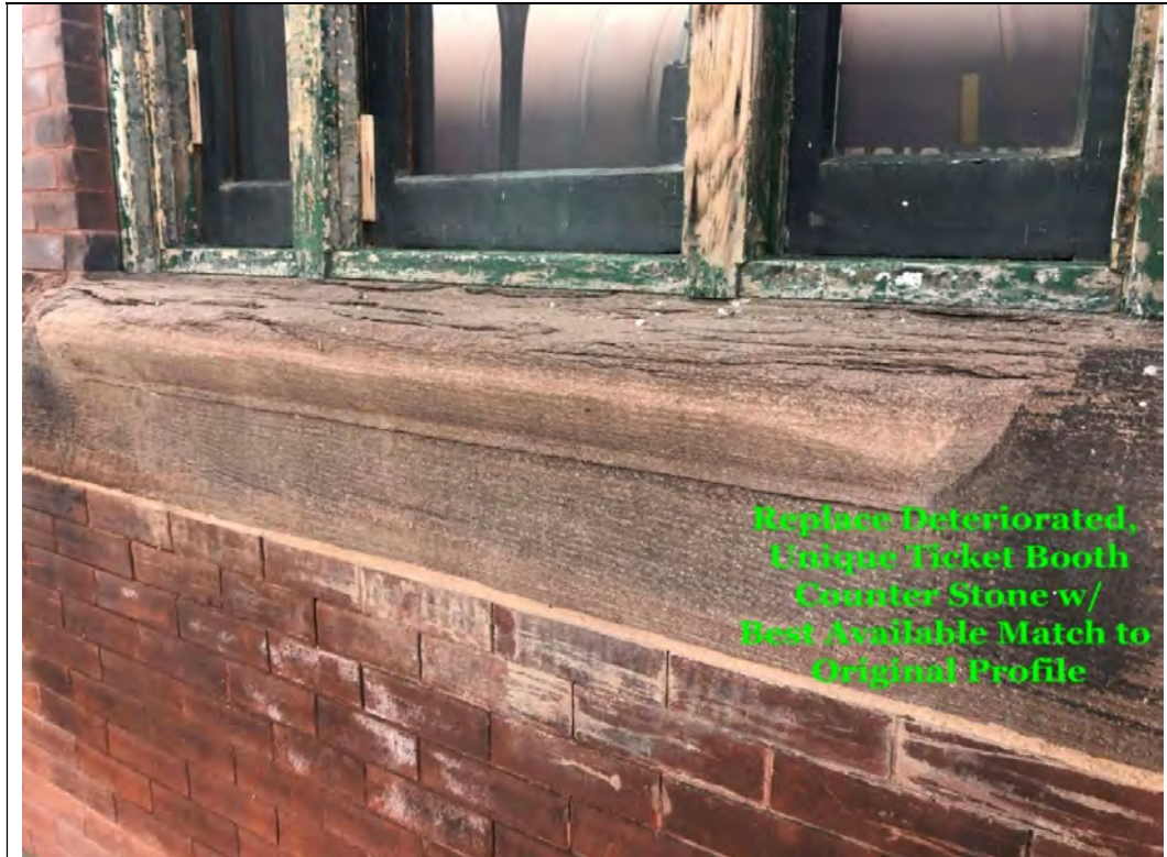
SANDSTONE WINDOW SILL RESTORATION – Preservation work still needed includes repointing, reconstructing, restoring and cleaning.

$825,000 capital campaign. Through July 2022, approximately two hundred donors have contributed a total of $310,178 toward the $550,000 matching funds required to earn the Jeffris grant.